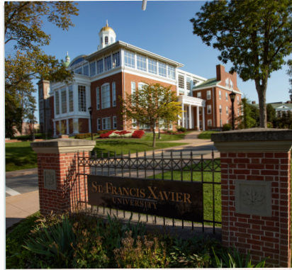
Study in University Classrooms