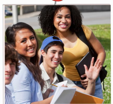
Make Friends from around the World