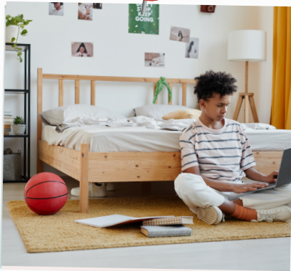
Live in a University Dorm

Students will develop critical thinking, debating, and analytical skills to ensure their preparedness for university studies conducted in English. Our program will empower students to build confidence in themselves while connecting with other international students.